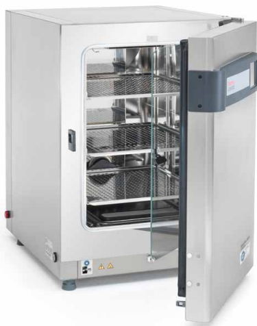
Thermo Scientific™ Heracell™ Vios™ CR CO 2 Incubator

Particulates sourced from equipment can be due to materials of construction, including painted surfaces, plastics, insulation and packaging materials, glass, metal parts with sharp edges, or crevices that could harbor microorganisms. It is difficult to estimate the number of particulates that could come from a given instrument; the only way to know for sure is by testing. And, for unbiased data, that testing should be performed by an independent third party, not by the manufacturer.